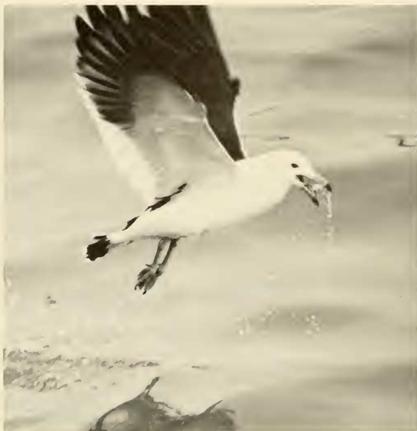
Figure 6. Band-tailed Gull ( Larus belcheri ) at Puerto Belgrano, Argentina.

In Chubut Province, the American Oystercatcher is abundant on the Valdes Peninsula (see Jehl et al., 1973). We also estimated 15-18 pairs at Punta Tombo (21-22 November 1973), and several pairs at Bahía Camarones (20 November). In Santa Cruz Province we found birds at Caleta Olivia (2 pairs, 19 November), Puerto Deseado (8 pairs plus 36 non-breeders, 19 November), Bahía Laura (16 birds, 18 November) and San Julián (5 pairs, 17 November). At San Julián we saw one bird flying inland along the river carrying food and another was obviously guarding a chick. Islands in the river mouth at Puerto Santa Cruz should provide adequate habitat for this species, but we were unable to visit them.